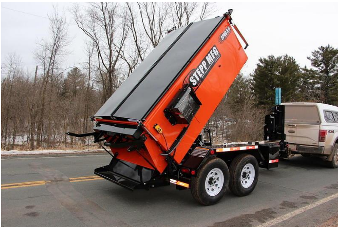
Hot Box Asphalt Trailer

The City of Auburn appreciates the community's patience during these projects and remains committed to maintaining and improving the infrastructure that supports daily life in Auburn. Residents are encouraged to follow city communications for updates as work continues.